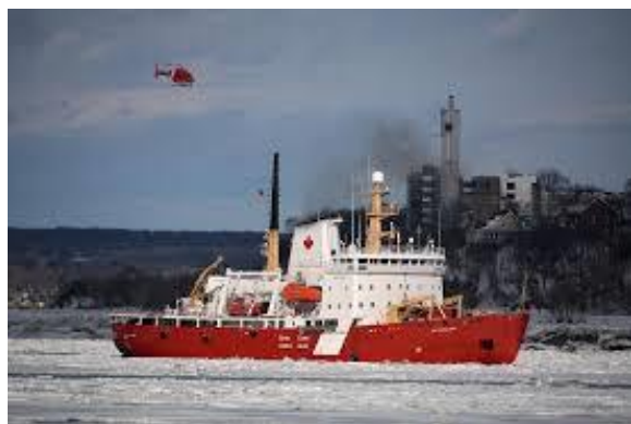
An icebreaker and in the background Lévis

More than 1,600 people from the Coast Guard work in the Central region, which covers the St. Lawrence and the Great Lakes, with a large part of the workforce based in Quebec City. You can easily recognize the base where you can admire the icebreakers at the wharf, near the Québec-Lévis ferry.