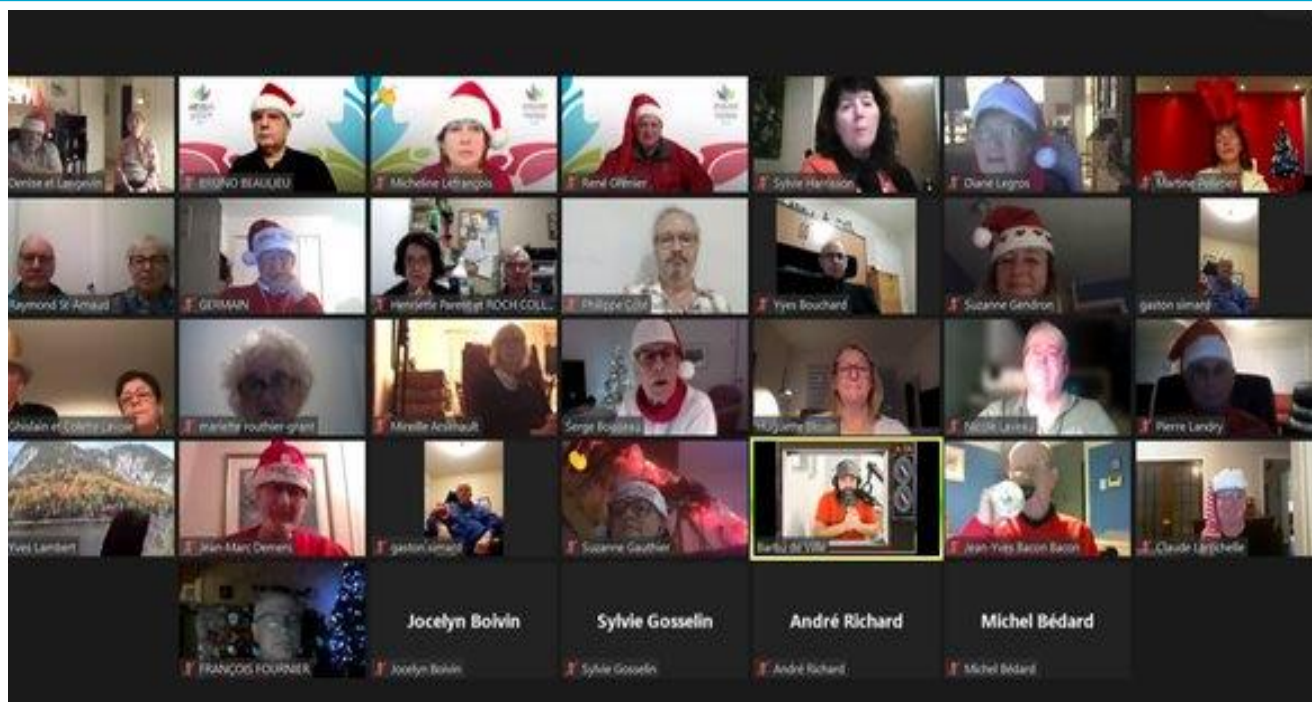
Des participants