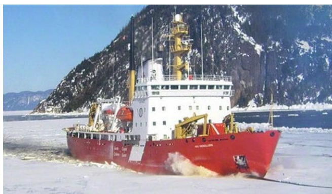
The CCGS Des Groseilliers in the Saguenay Fjord