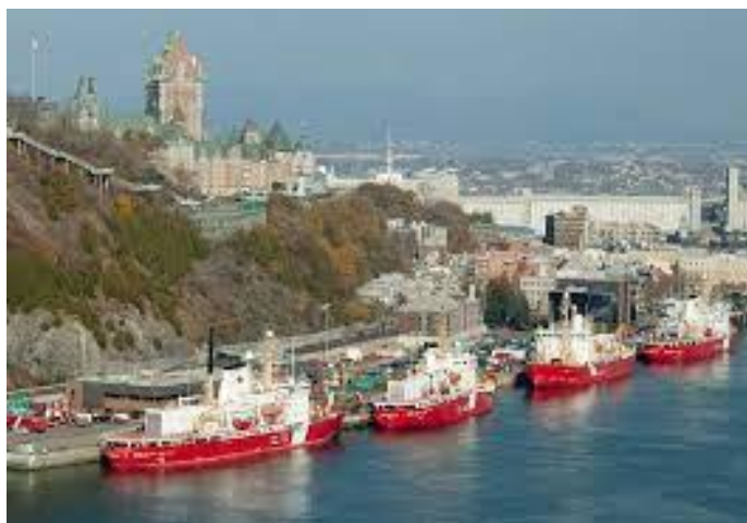
The CCG fleet (in part) at the quayside in Quebec

More than 1,600 people from the Coast Guard work in the Central region, which covers the St. Lawrence and the Great Lakes, with a large part of the workforce based in Quebec City. You can easily recognize the base where you can admire the icebreakers at the wharf, near the Québec-Lévis ferry.